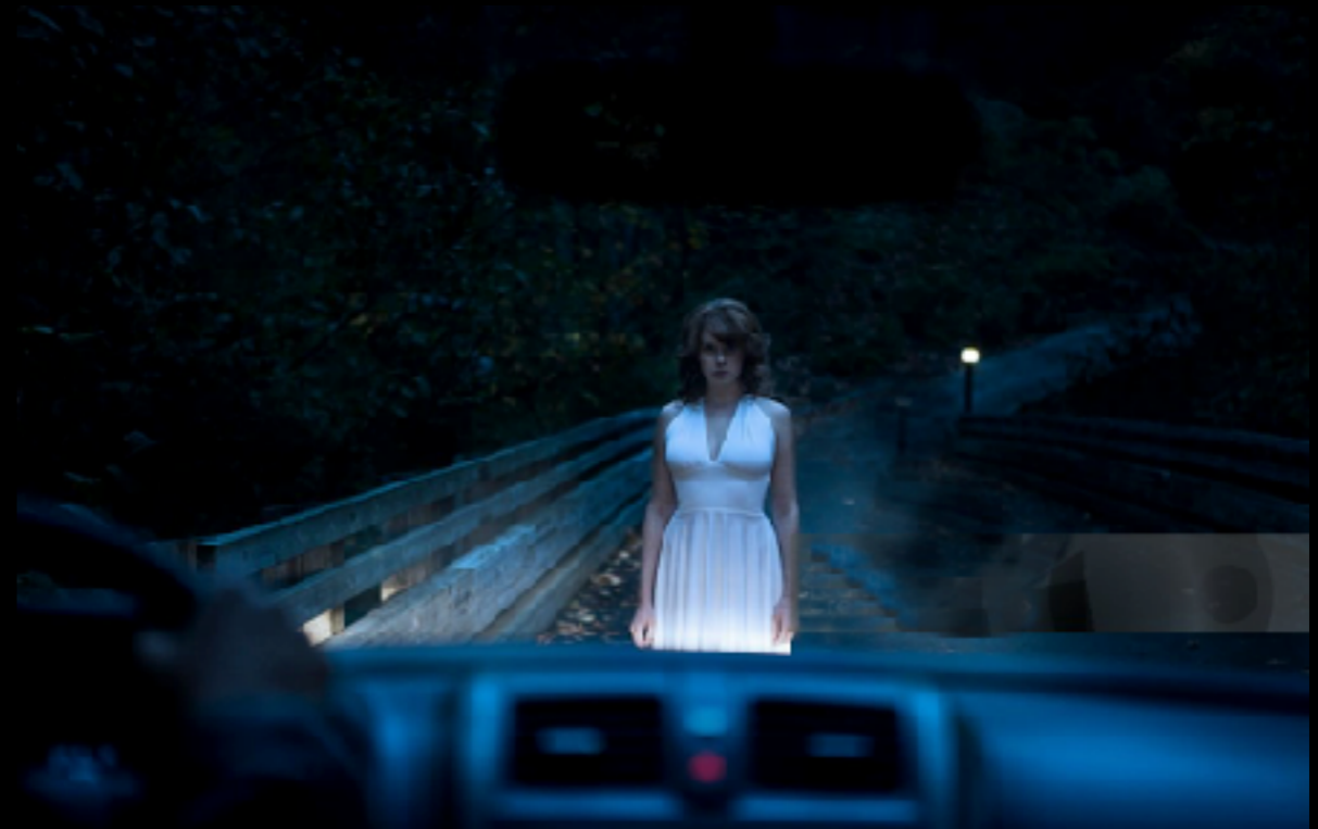
Mullholland Drive inspired